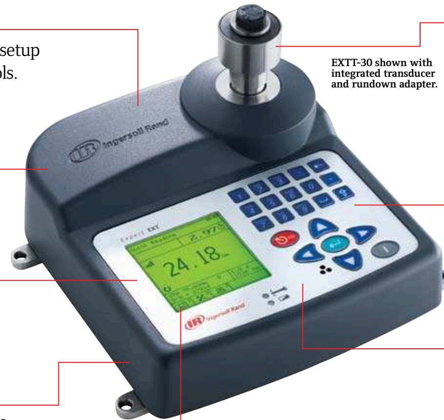
EXTT-30 shown with integrated transducer and rundown adapter.

Compact and lightweight with rechargeable battery provides ease of use and portability on the assembly line and space savings on the workbench.